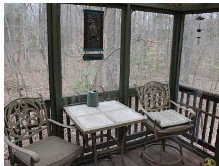
Screened porch off master