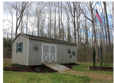
12x24 shed with electricity