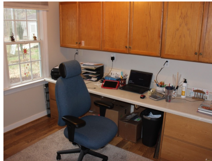
Functional home office.