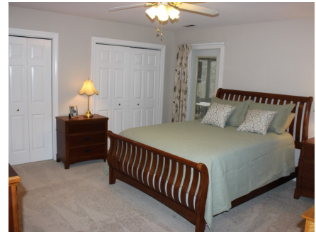
New carpet in 15x15 master