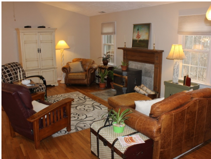
Vaulted great room w/skylights

Thanks to a 1999 addition, this 1566 sq.ft. home has 2 master bedrooms, a third bedroom, an office, & screened porch off the new master. There are beautiful hardwood floors in the great room & ceramic floors in the renovated kitchen & bathrooms. Only 5 miles west of Gum Spring, off Rt. 250.