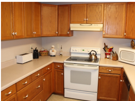
Ceramic floored kitchen