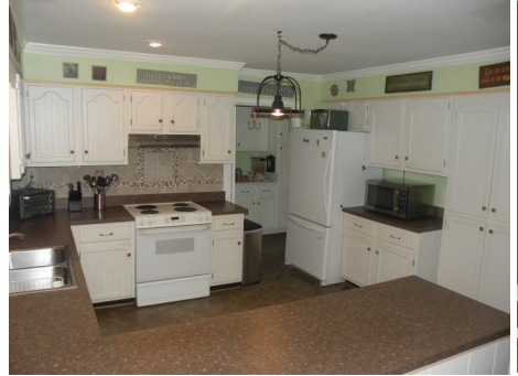
All appliances stay in kitchen