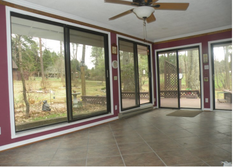
Heated Florida room, 12x23