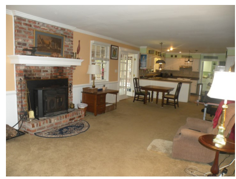
Family Rm & Kitchen, total 38'