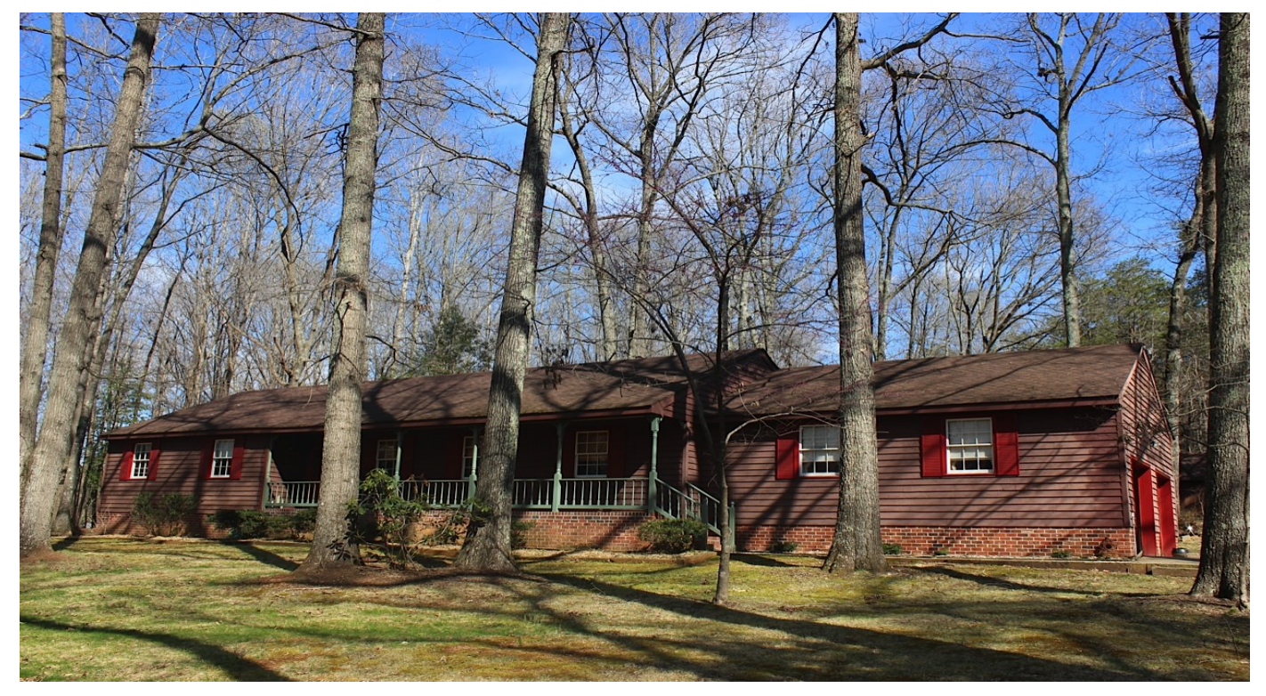
On 4.12 Acres in Timber Ridge

This cedar rancher offers a lot of living space, 3 bedrooms, & 2 baths. With hardwood floors in the formal rooms and bedrooms, ceramic tile baths, an open kitchen/family room, tiled Florida room, attached 2-car garage and detached workshop/shed, this is an ideal country home. Only ten minutes west of 288, with DSL.