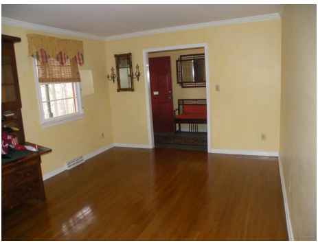
12x18 living room