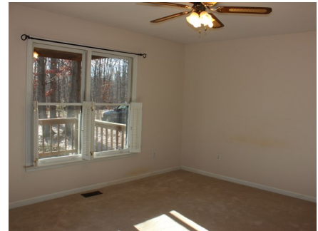
New carpet in all bedrooms.