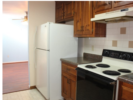
Fully equipped galley kitchen.