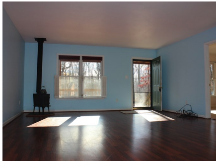
Great room with woodstove

Note the standing seam metal roof, one of the unusual quality features of this 3 bedroom, 2 bath cedar home. A ramp from the side door leads to the 2-car carport. The heat pump is only 3 years old, the wooded lot is nice & level, and this well-cared for home is only 2 miles to I-64 at Shannon Hill.