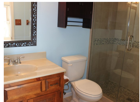
New glass shower in master bath