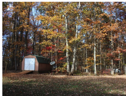
Shed in fenced back yard.