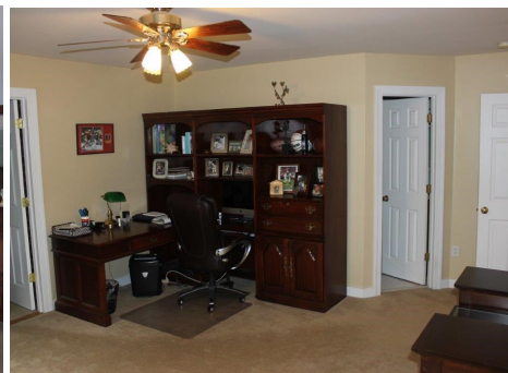
Former master now office/exercise