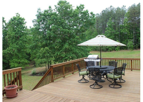
New deck all across rear of home