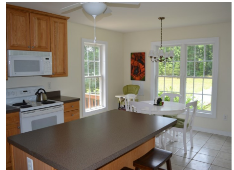
Ceramic floored eat-in kitchen.