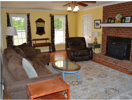
Family room w/hardwood floors

On 7.16 Acres, less than 10 min. to I-64 at Gum Spring. 3 bedrooms + office, 3.5 baths