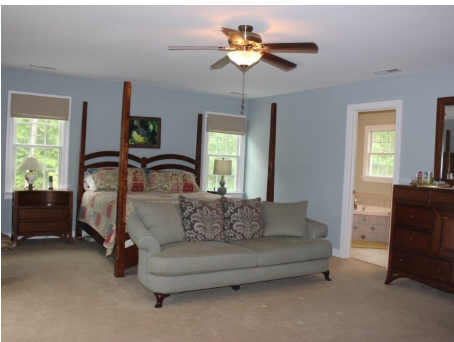
New Luxury Master Bedroom