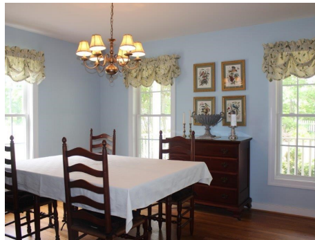
Formal dining room