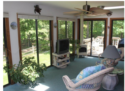
Florida room has 2 skylights.