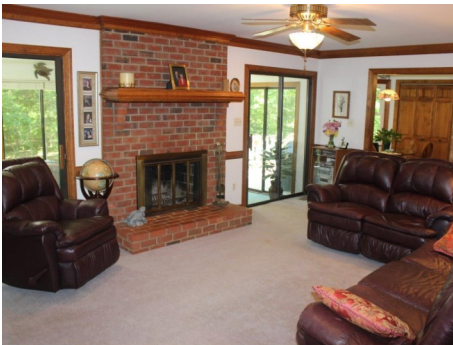
Hardwood floors under the carpet.

This 3-bedroom, 2.5 bath brick home has a first floor master bedroom, full basement with hobby room, easy access walk-in attic, spacious Florida room overlooking the fenced back yard, and step-saving galley kitchen. There are walking trails through the woods, and the James River boat ramp is only a mile away.