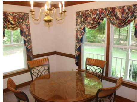
Formal dining room