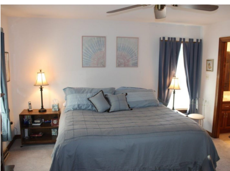
First-floor master suite!