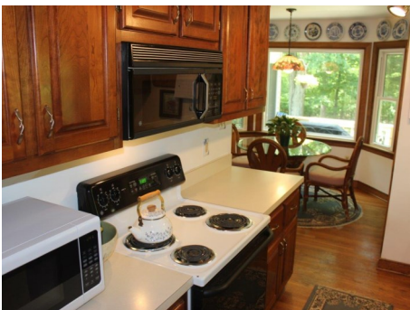
Kitchen has pantry & pull-out shelves