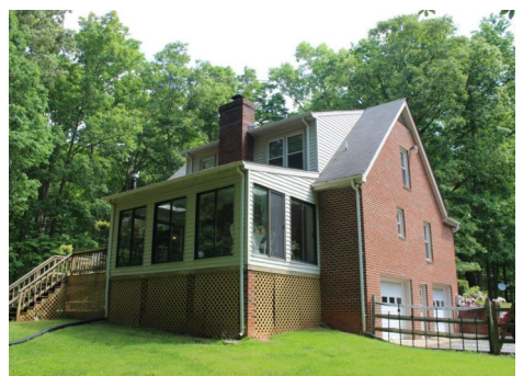
Full basement is partially finished.