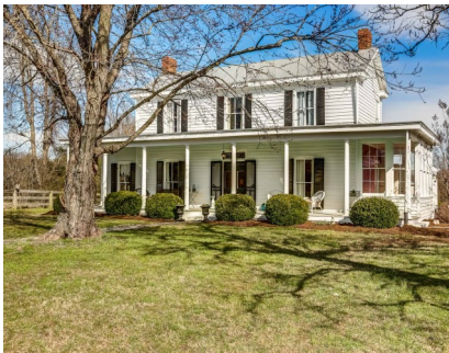
55' porch w/Jefferson windows

Wonderfully renovated in 2005 and continuously improved since, this 3 bedroom, 2 1/2 bath home has the original siding, windows, pine floors, woodwork, & mantels for all 6 fireplaces. The huge walnut pocket doors between living & dining room are original and still slide at the touch of a finger. The tin roof is in terrific condition, and the patio with pergola & fire pit off the back porch is a great addition.