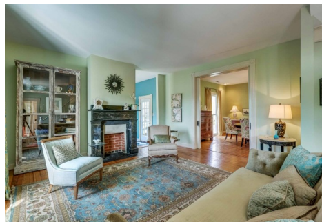
Living rm w/pocket doors to dining rm