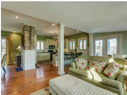
Columns set off family room from kitchen with granite breakfast bar..