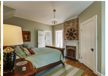
1st flr master with sitting room