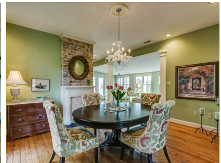
Dining room , 1 of 6 fireplaces