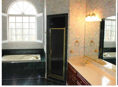
First floor master bathroom.