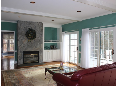
See-thru fireplace in family room.