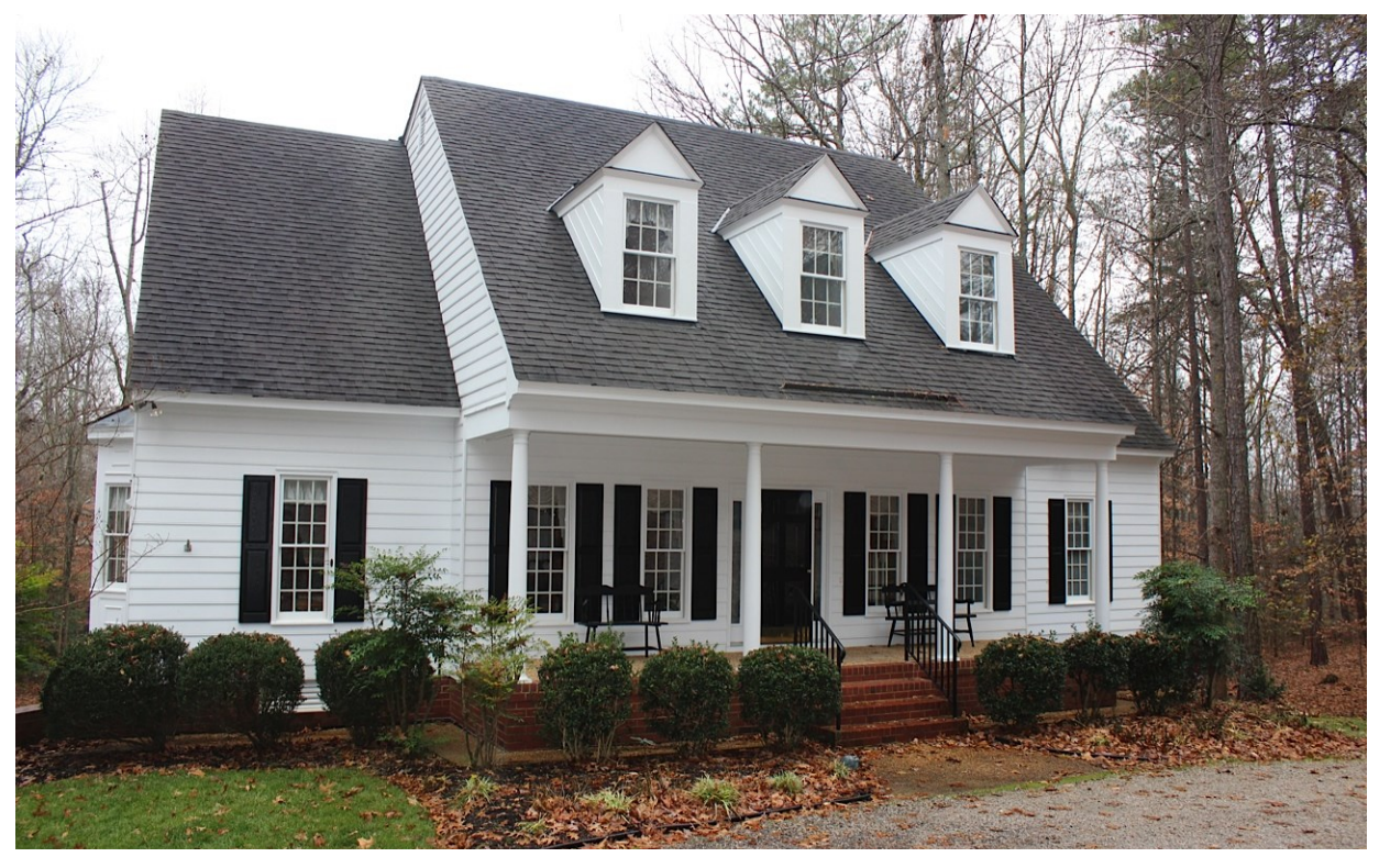
On 2.62 Acres in Manakin-Sabot

Thoughtfully designed & immaculately maintained, this 4 bedroom, 3 1/2 bath Cape is surprisingly open, with a 2-story foyer, see-thru fireplace in family room & kitchen, first floor master suite, 2-car garage in the basement, and exceptional woodwork throughout. Ready for you to move in!