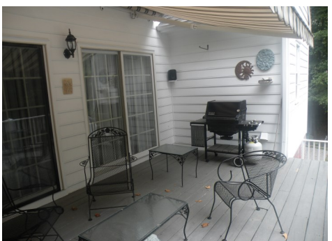
Deck with awning.