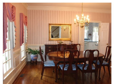
Dining Room open to Foyer

Thoughtfully designed & immaculately maintained, this 4 bedroom, 3 1/2 bath Cape is surprisingly open, with a 2-story foyer, see-thru fireplace in family room & kitchen, first floor master suite, 2-car garage in the basement, and exceptional woodwork throughout. Ready for you to move in!