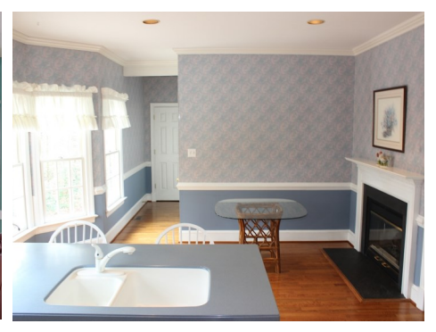
Kitchen side of fireplace.