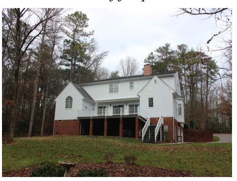
Storage room beside garage.