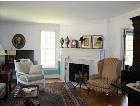
Living Rm , corner fireplace

This Williamsburg charmer is loaded with good Colonial details, from the cobblestone-lined drive to the cedar shake roof. There are 3 or 4 bedrooms, 2 1/2 baths, 2-car garage, 2 fireplaces, hardwood floors, lots of crown molding and chair rail, and terrific patio & deck. Move in & enjoy!