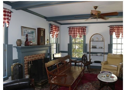
Family Rm fireplace w/gas logs