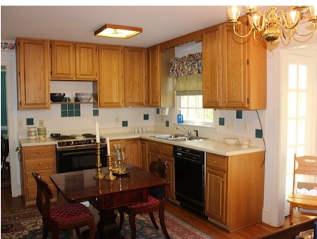
Kitchen w/French doors to deck