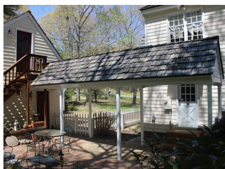
Covered walk from garage to home