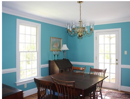
Dining Rm with door to deck