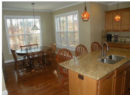
Granite/stainless steel kitchen