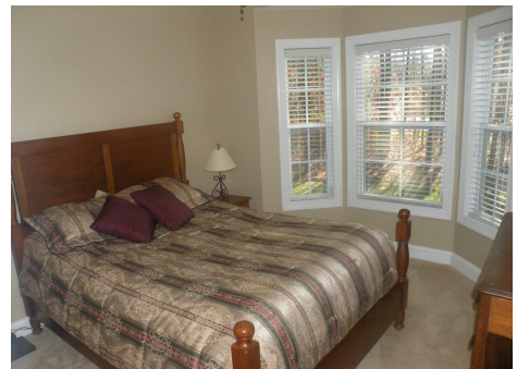
First-floor bedroom for Grandma!