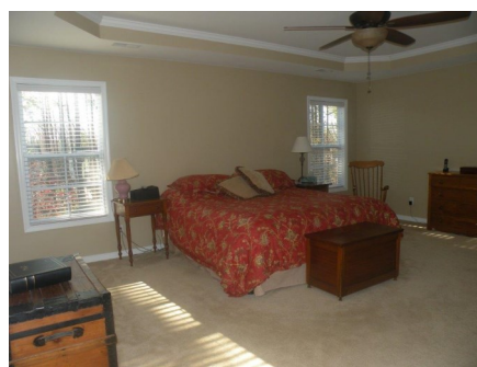
Master Bedroom with 2 walk-ins.