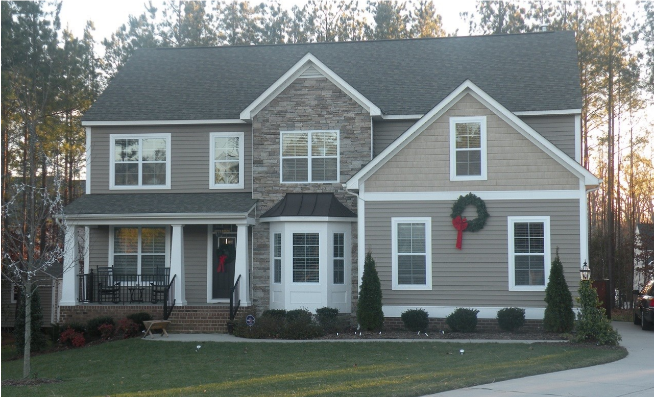
Main Street Home's Callaway II in Westerleigh

Better than new! Meticulously maintained & improved since its first sale in March, 2011, this 5 bedroom, 3 bath home sits on a prime Westerleigh lot. The open floor plan, 9' ceilings, & hardwood floors give the spacious first floor a gracious feel with great flow. With large bedrooms & generous closets, this is the ideal home for the growing family, served by Chesterfield's best schools.