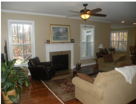
Family Room with gas fireplace.

Better than new! Meticulously maintained & improved since its first sale in March, 2011, this 5 bedroom, 3 bath home sits on a prime Westerleigh lot. The open floor plan, 9' ceilings, & hardwood floors give the spacious first floor a gracious feel with great flow. With large bedrooms & generous closets, this is the ideal home for the growing family, served by Chesterfield's best schools.