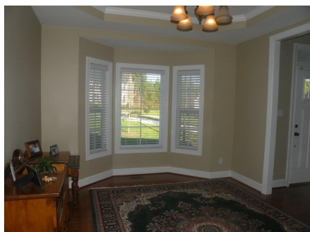
Dining Room with tray ceiling.