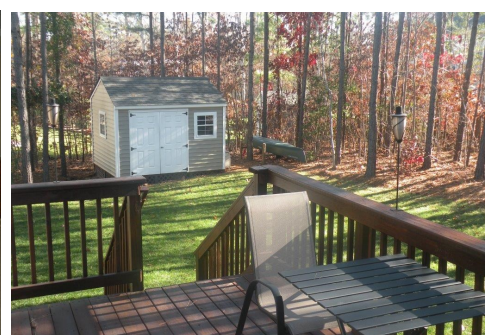
Nicely shaded, private back yard.